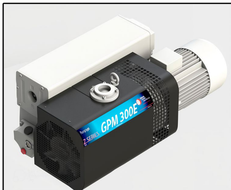
GENERAL EUROPE VACUUM GP/GPM300E Z Series